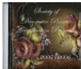
2005-2006 Certification CD Rom

This update includes articles from 2007 and 2008. Slip this update into your Collection of Educational Certification Articles, Book 2 to complete the set.